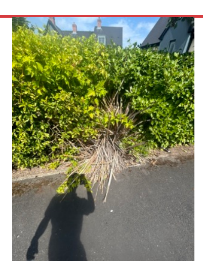
ACTION Assigned To M&BG Remove dead phormium