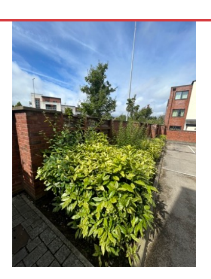
ACTION Assigned To M&BG Trim hedges