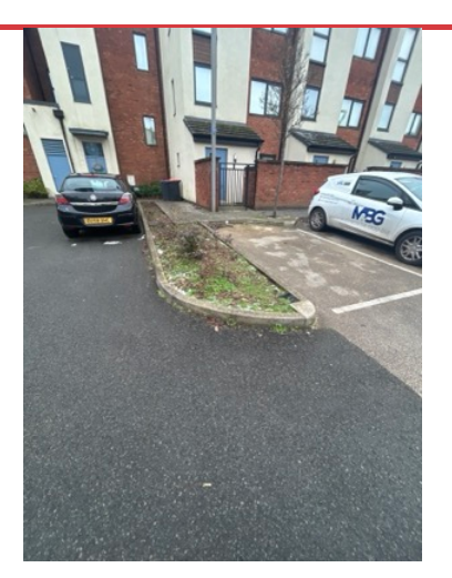
ACTION Assigned To M&BG Clear weeds