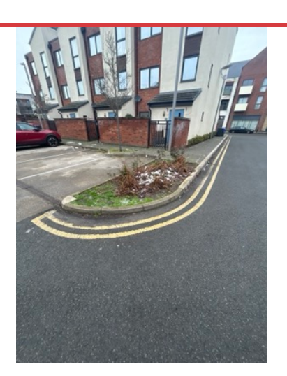
ACTION Assigned To M&BG Turn over bedding