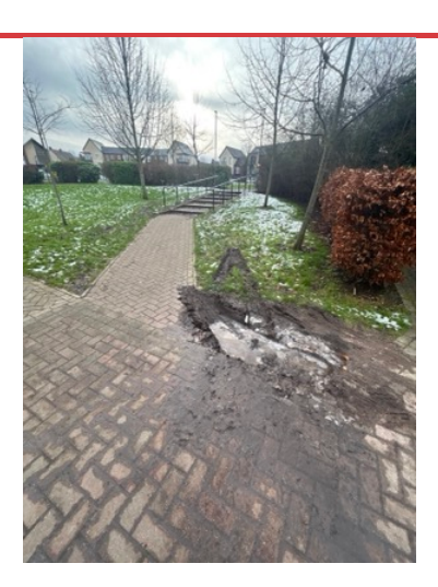
REPORT Assigned To BVT Damaged grass