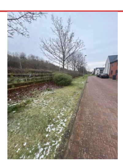
ACTION Assigned To BVT Clear leaves