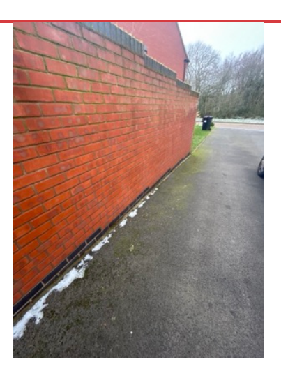
ACTION Assigned To M&BG Apply algaecide