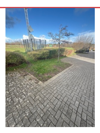
REPORT Assigned To BVT Damaged grass from cars turning