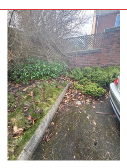
ACTION Assigned To BVT Clear leaves