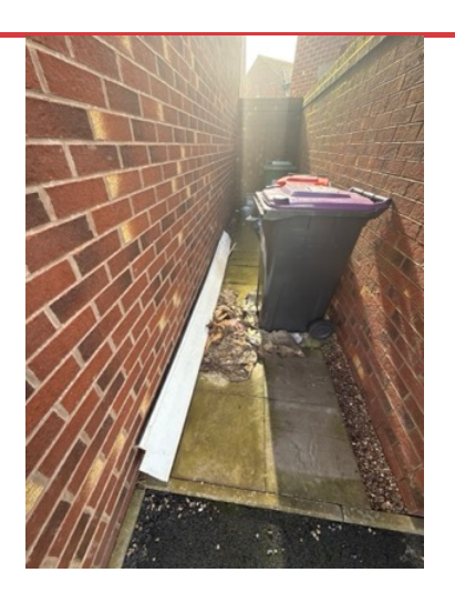
ACTION Assigned To BVT Litter to be cleared in Courtyard