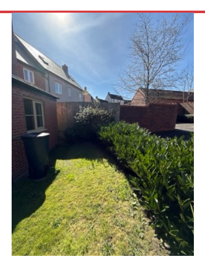
ACTION Assigned To M&BG Cut Hedges