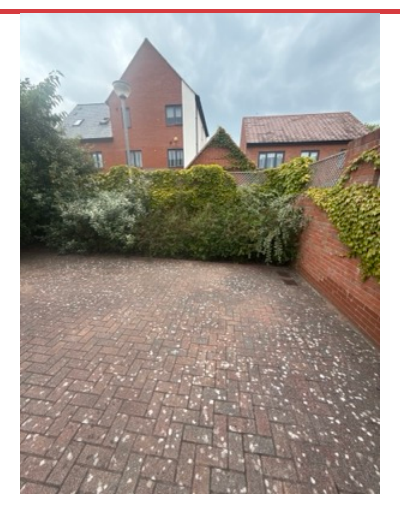
ACTION Assigned To M&BG Trim hedges