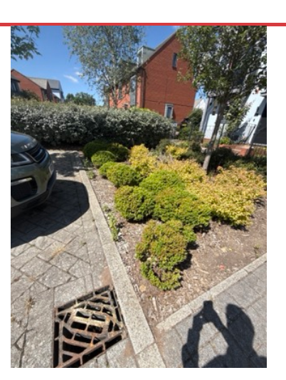
ACTION Assigned To M&BG Clear weeds