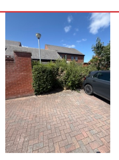
ACTION Assigned To M&BG Cut hedges