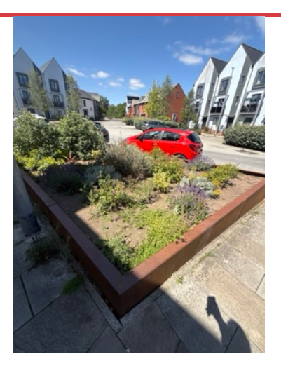
ACTION Assigned To M&BG Clear weeds in planter