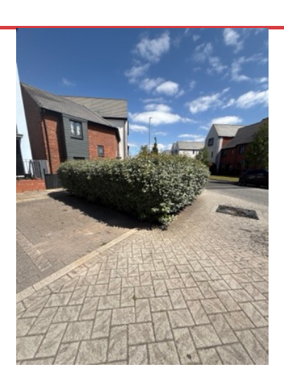
ACTION Assigned To M&BG Trim hedge