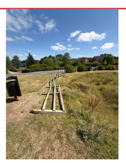
REPORT Assigned To BVT Fence has fallen down