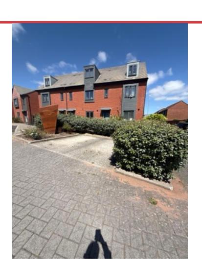
ACTION Assigned To M&BG Cut hedges