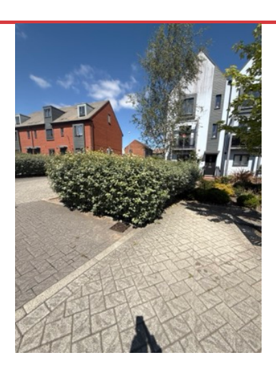
ACTION Assigned To M&BG Cut hedges