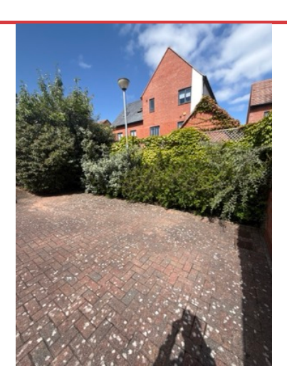
ACTION Assigned To M&BG Trim hedges