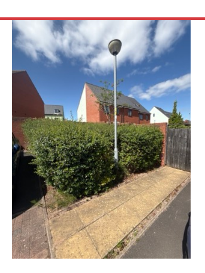
ACTION Assigned To M&BG Cut hedges