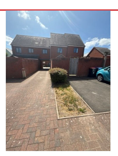
ACTION Assigned To M&BG Cut hedges