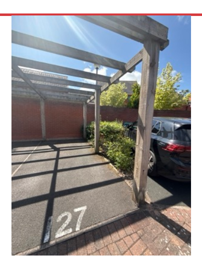
ACTION Assigned To M&BG Cut hedges