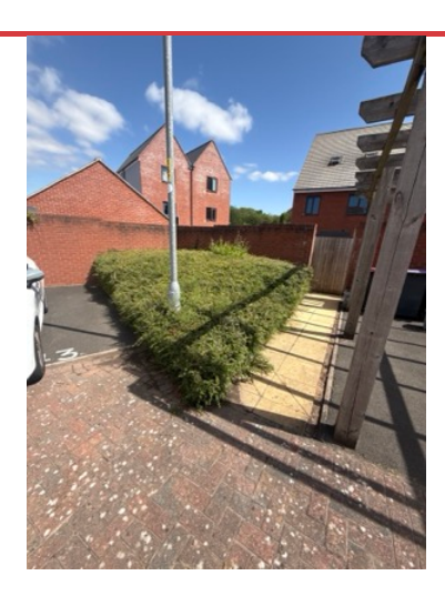
ACTION Assigned To M&BG Cut hedges